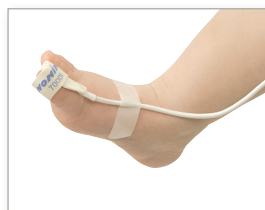
7000I Infant (2-20 kg / 2.2-44 lbs)