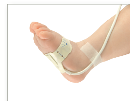
7000N Neonatal Neonate: (< 2 kg / < 4.4 lbs) Adult: (> 30 kg / > 66 lbs)

All sensors are packaged in 24-pack cartons. Use only with Nonin pulse oximetry.