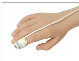
7000P Pediatric (> 10 kg / 22 lbs)