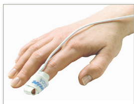
7000A Adult (> 30 kg / > 66 lbs)