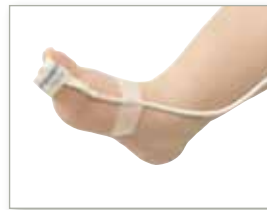
7000I Infant (2-20 kg / 4-44 lbs)