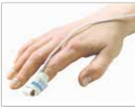
7000A Adult (> 30 kg / > 66 lbs)