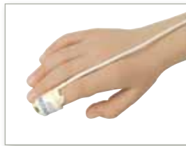
7000P Pediatric (10-40 kg / 22-88 lbs)