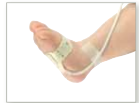
7000N Neonatal (< 2 kg / < 4.4 lbs)