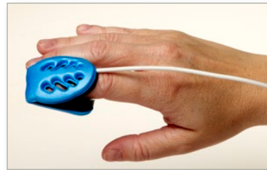
6500MA Durafoam Disposable Sensor - Small Adult/Pediatric

Package – box of 5 sensors . Use only with Nonin pulse oximetry.