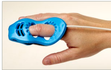
6500SA Durafoam Disposable Sensor - Standard Adult/Pediatric