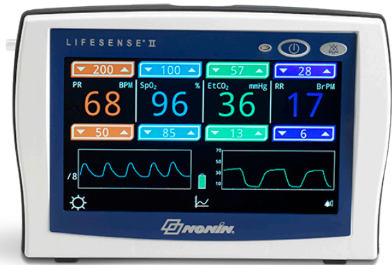
LifeSense® II WIDESCREEN™ Capnograph and Pulse Oximeter

All models feature Nonin sidestream EtCO 2 technology, which delivers fast, first-breath detection of respiratory rate and EtCO 2 . LifeSense models include pulse oximetry functions with exclusive Nonin PureSAT® technology.