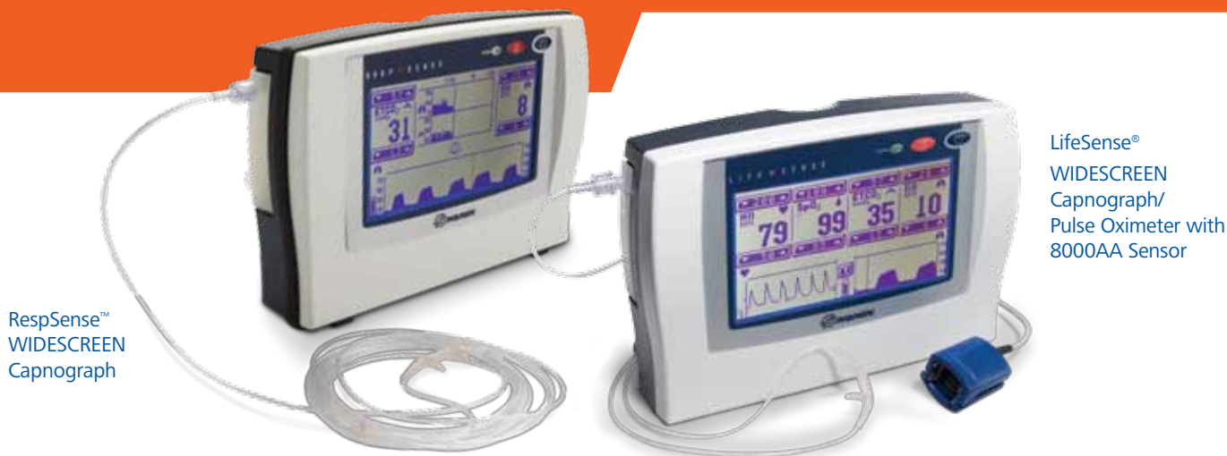
RespSense™ WIDESCREEN Capnograph

The RespSense™ and LifeSense® capnography monitors from Nonin Medical provide continuous and reliable monitoring to help identify potentially life-threatening ventilation status changes such as respiratory depression during procedural sedation.