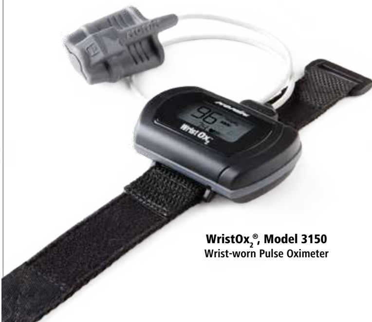
WristOx 2 , Model 3150 Wrist-worn Pulse Oximeter

The WristOx 2 , Model 3150 with MVI mode provides a graphic display of the amount of recorded data in hours and minutes. MVI mode provides assurance that sufficient data has been recorded; preventing unnecessary trips for repeat recordings, reducing costs, and improving overall efficiencies.