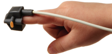
Nonin 8000SS Small Soft Sensor (7.5 mm–12.5 mm / 0.3–0.5 in digit thickness)

After using pulse oximeter sensors from different manufacturers, we were dissatisfied with their performance. They were unable to quickly and accurately capture a reading consistently in patients. We require a sensor that works with the smallest of infants and children, is cleanable for reuse, has user-friendly tape and most importantly, will read quickly and accurately in unpredictable patient situations. Our distributor suggested we try Nonin Medical pulse oximeters. A Nonin Medical sales representative allowed PM Pediatrics to trial a unit with multiple sensor options. PM Pediatrics chose the Nonin 8000SS Small Soft Sensor and the Nonin 8008J Infant Flex Sensors and Disposable Wraps.