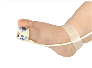
Infant Flex System (2–20 kg / 4.4–44 lbs)

Additionally, the training and implementation process with Nonin Medical was turn-key for our staff. A sales representative gave a quick demonstration with useful handouts on proper use and handling. Our team had no difficulty transitioning to the Nonin Medical brand of pulse oximetry.