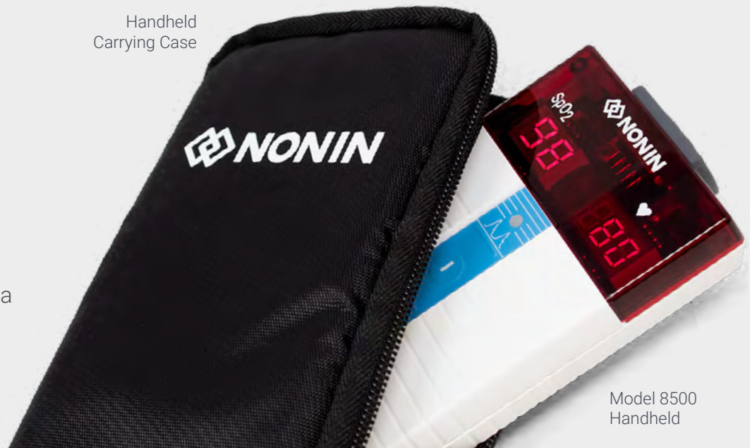
Model 8500 Handheld