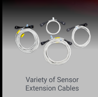
Variety of Sensor Extension Cables