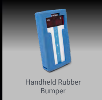
Handheld Rubber Bumper